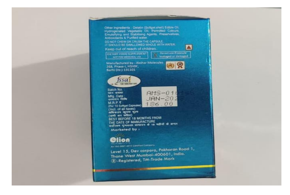
Seizure at Tarnaka, Secunderabad